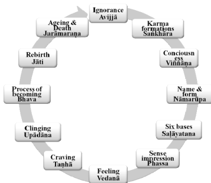
Figure 2. Twelve Links of Dependent Origination

craving, thirst, unwholesome desire; and chanda , meaning wholesome and sincere desire for well-being. Taṇhā and chanda both seek satisfaction, but of different kinds. Taṇhā , the desire for pleasure objects, is based on ignorance (Pali: avijjā , Skt.: avidyā ) and will lead to economic activities motivated by greed, causing the destruction of the earth. Thus, we will see the Twelve Links of Dependent Origination (Pali: paticcasamuppāda , Skt.: pratītyasamutpāda ) 16 within such economic activities. These Links result in the cycle of birth and death (Pali & Skt.: saṃsāra ) and are the cause of suffering (Pali: dukkha , Skt.: duḥkha ). Taṇhā is the eighth link of the Twelve Links of Dependent Origination and is the root of economic problems. The Twelve Links are as Figure 2: